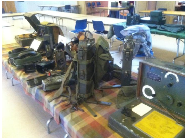
Military radios and equipment on display