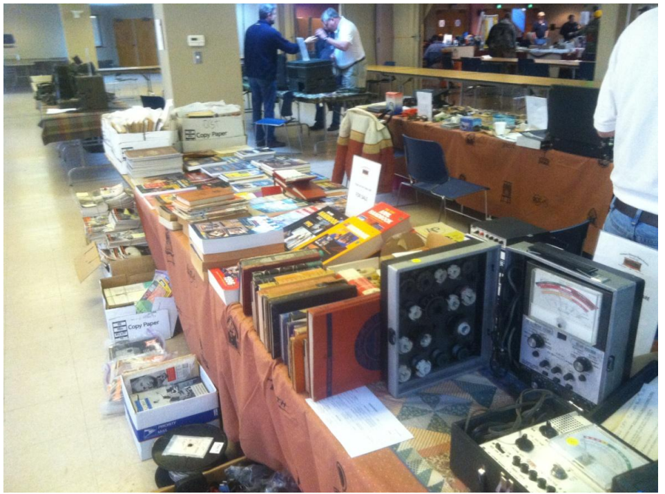
Books, magazines and test equipment for sale