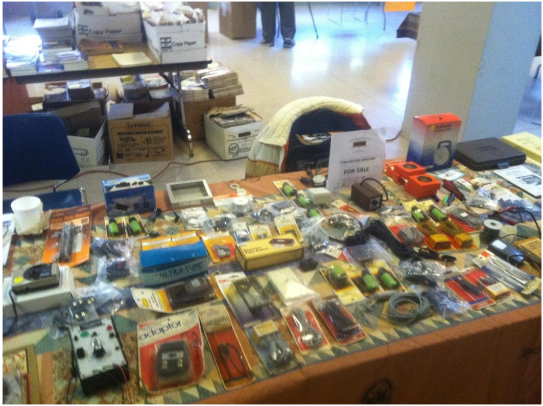
Cables, cords, connectors, speakers and junk for sale