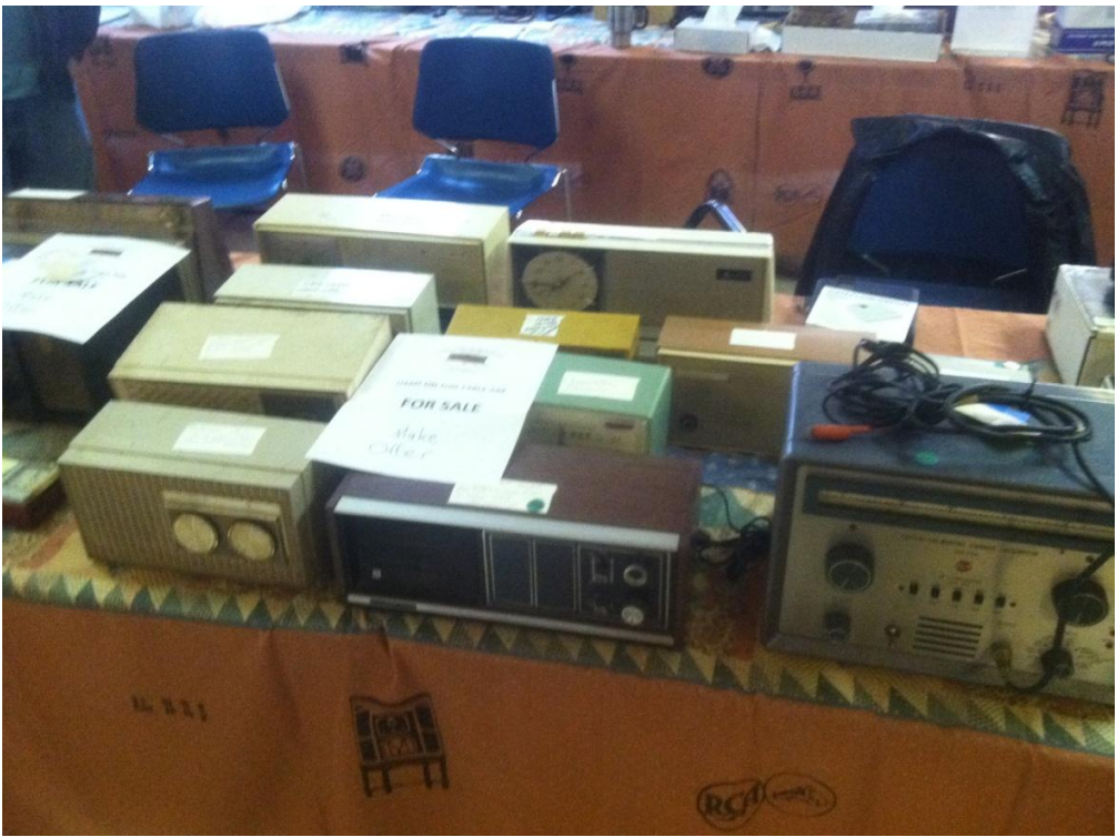
Plastic radios and test equipment for sale