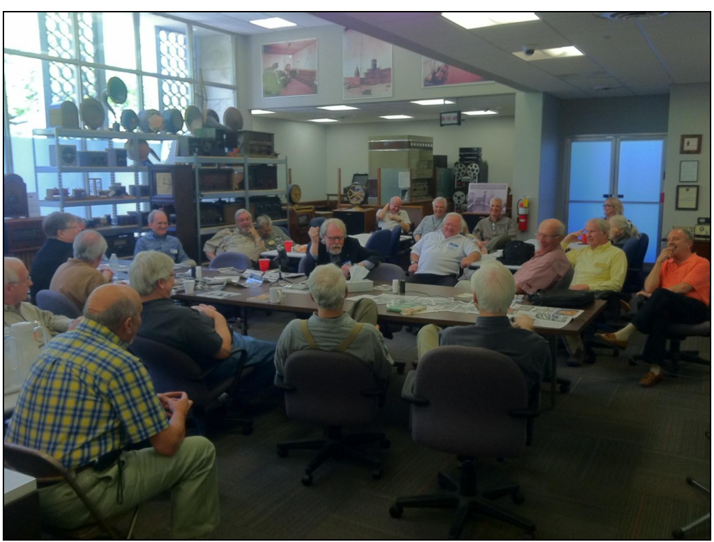
2014 Legends of Broadcast