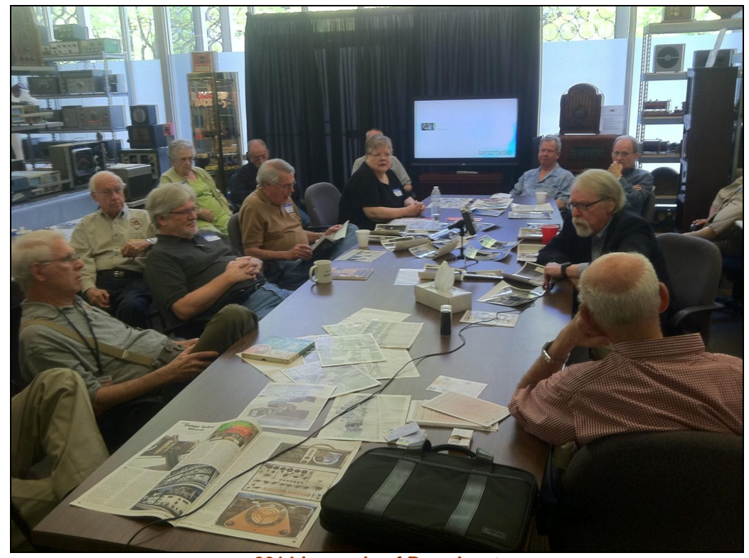
2014 Legends of Broadcast