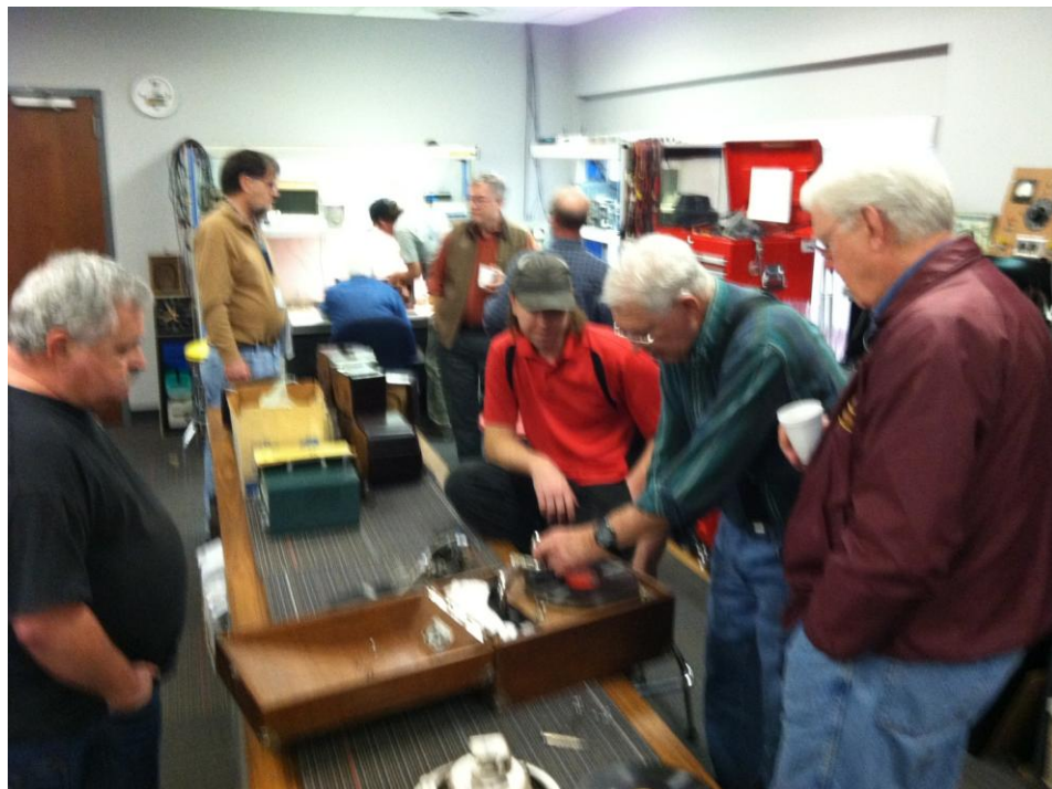
Other Shop activity while the radio class was going on