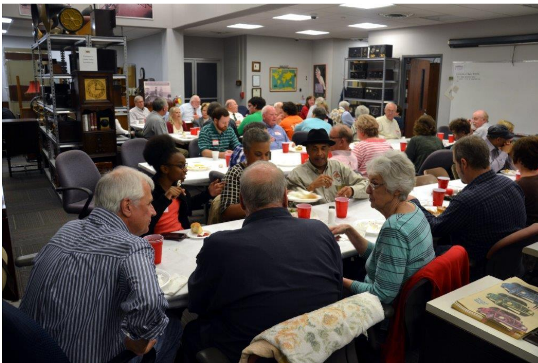
Enjoying dessert and some fellowship