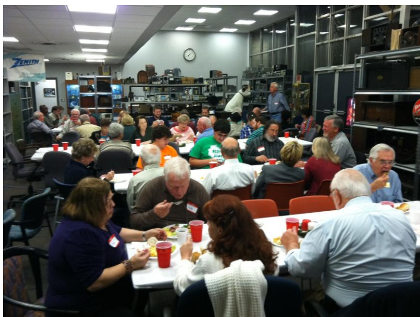
Everyone eating a great meal prepared by the members