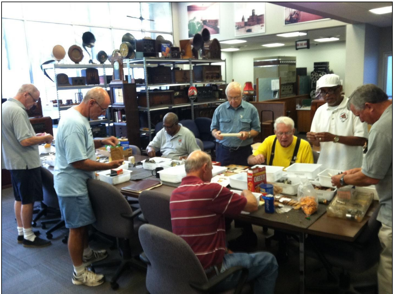
Members sorting through donated radio parts during a Tuesday workday