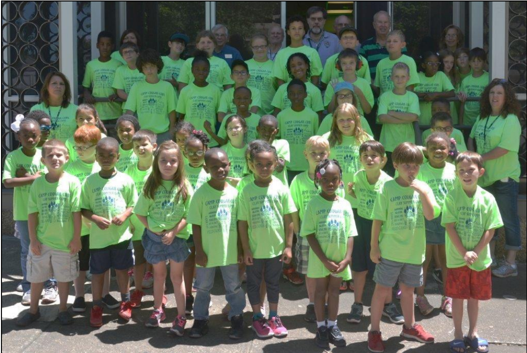
The Clay Community School tour group on the front steps of the Shop.

Schools continue to choose our Museum and Shop for tours to teach younger students the history of old radios. The tours also remind those older teachers and chaperones of the radios they listened to growing up. A large group from Clay Community School recently toured the Shop and Museum.