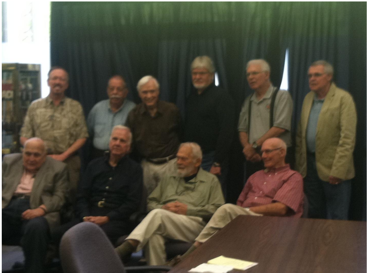
2013 Legends of Broadcast