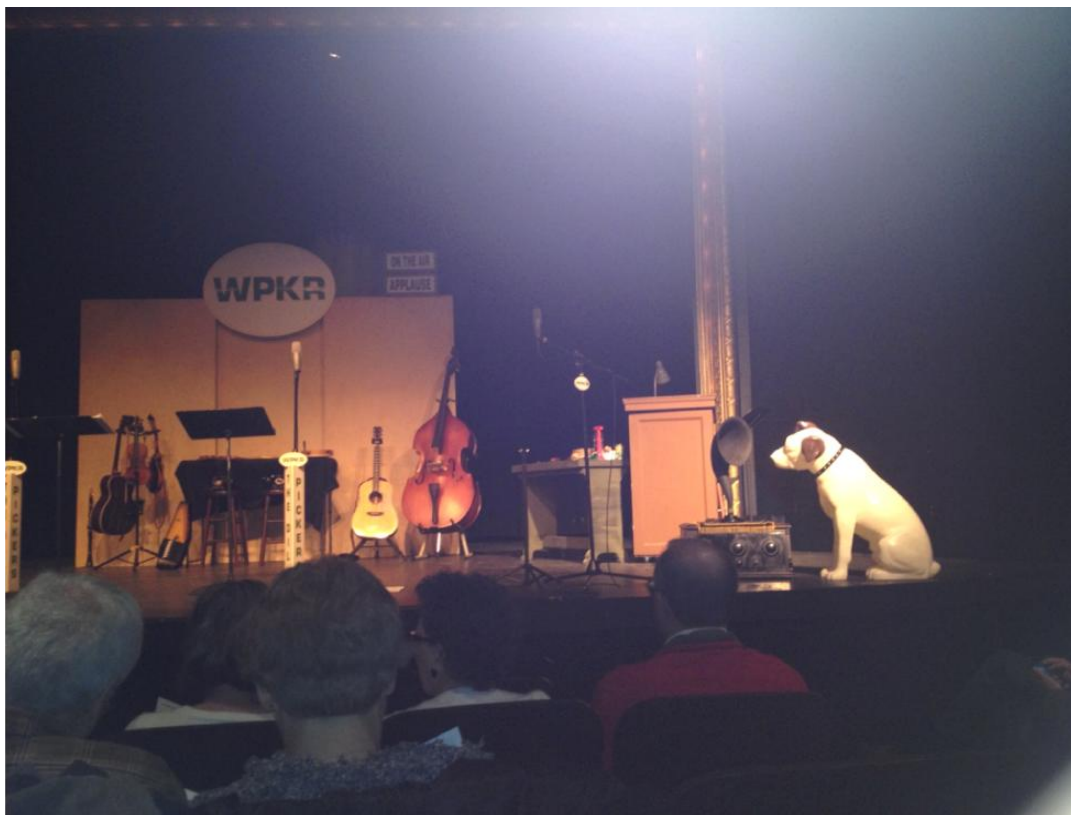
Stage Shot with Nipper