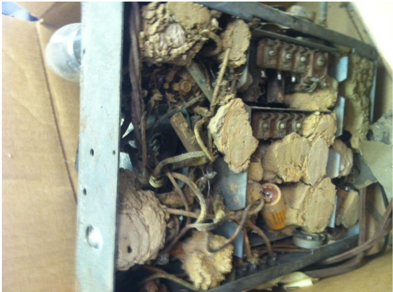
Dirt Dobber Radio

We continue to have folks drop off radios for repair. Last week, one came in from Madison, MS. These two folks drove five hours one way to get their radio to us. The console cabinet had been refinished and looked good, except for the streak across the top (that's what doilies are for). However, the radio chassis was another story. I have included a picture which does not fully show the issues, but you will get the point. I got at least two pounds of clay and dirt out of this chassis and that's just to get to the components that will surely need to be replaced. The hits keep comin'.