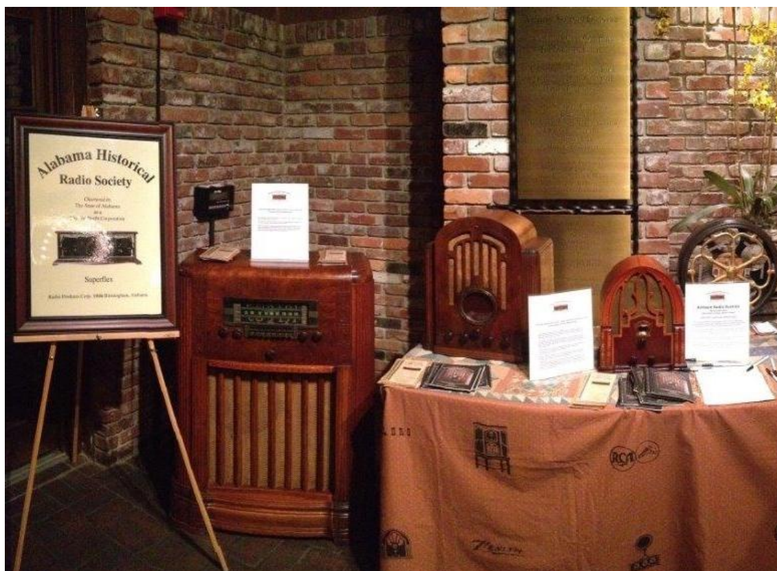
Virginia Samford Theater Lobby Display

There have been so many things going on at your Society, where to start? Thirty-four of us attended the Old Time Radio Show at the Virginia Samford Theatre on February 22, and had a great time! There are several pictures here from the event: