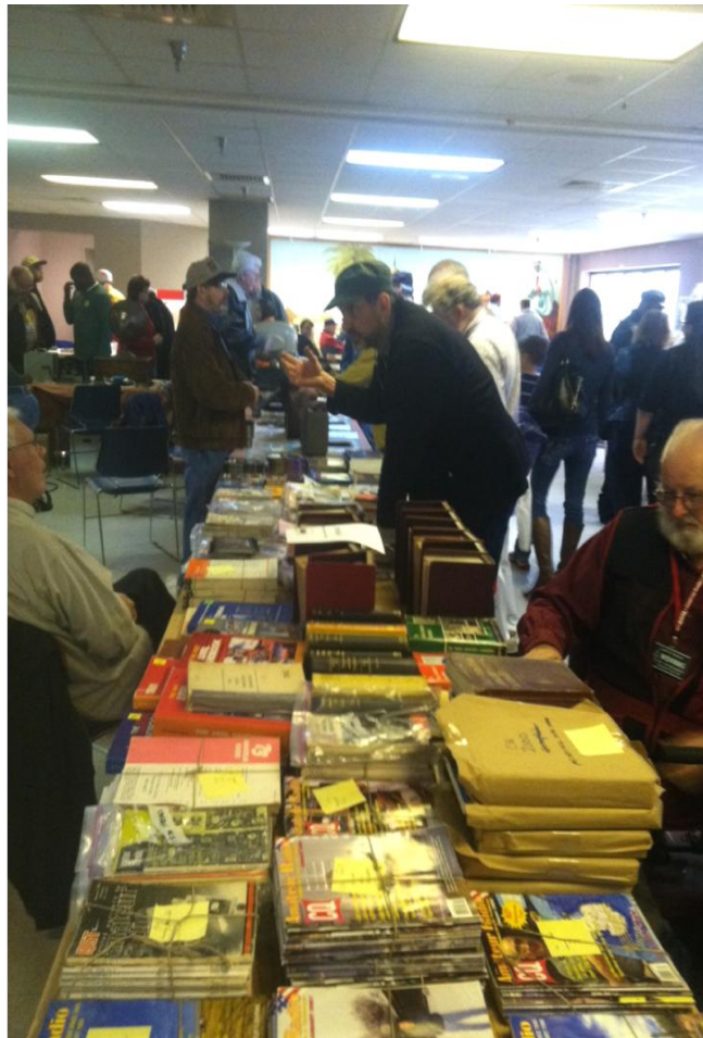
Ham Fest Sales Tables