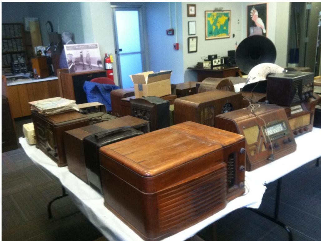
Leigh Estate Radios