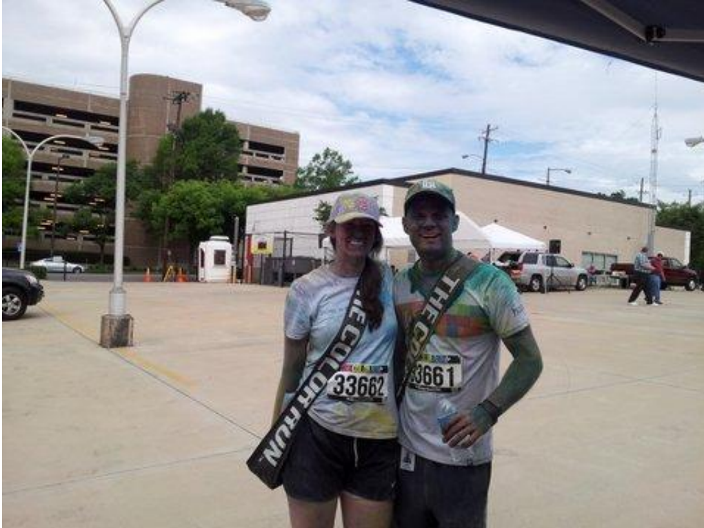
Color Run Runners even stopped by