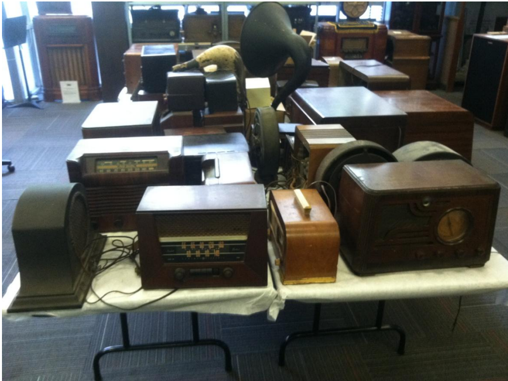
Leigh Estate Radios