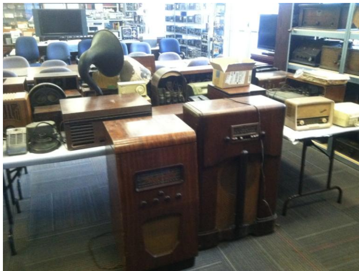
Leigh Estate Radios