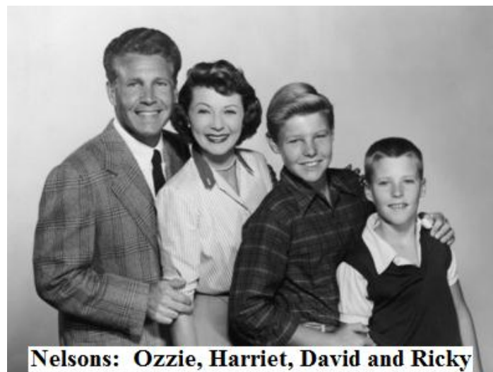
Nelsons: Ozzie, Harriet, David and Ricky

Here's a shot of the Nelson family taken in the early 1950s: