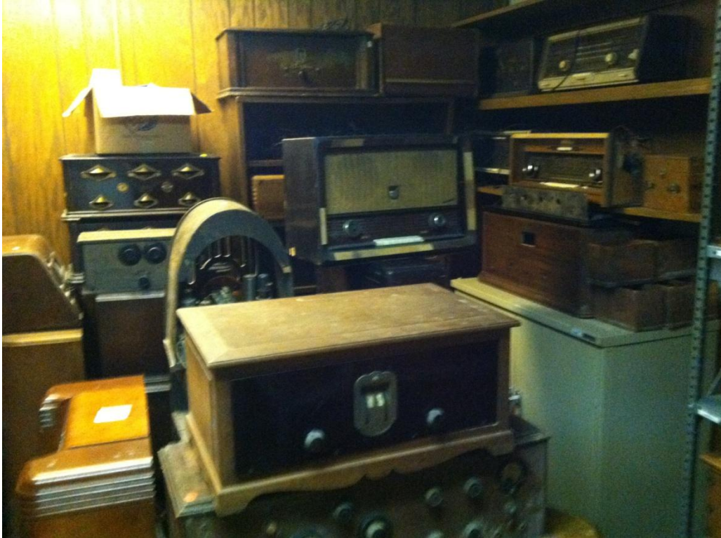
More Old Radios to be moved