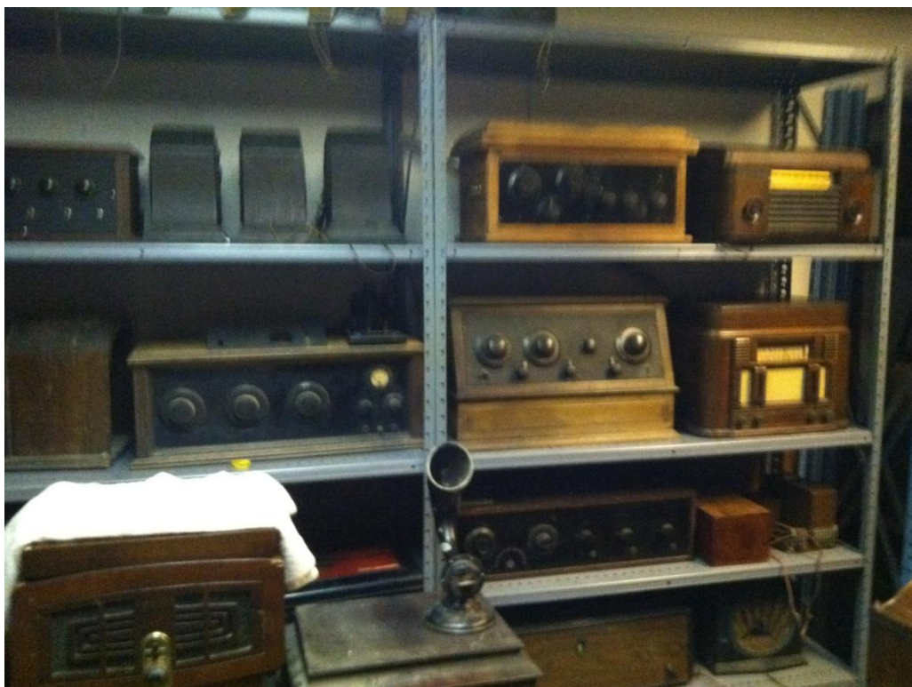
Old Radios and Speakers that must be moved