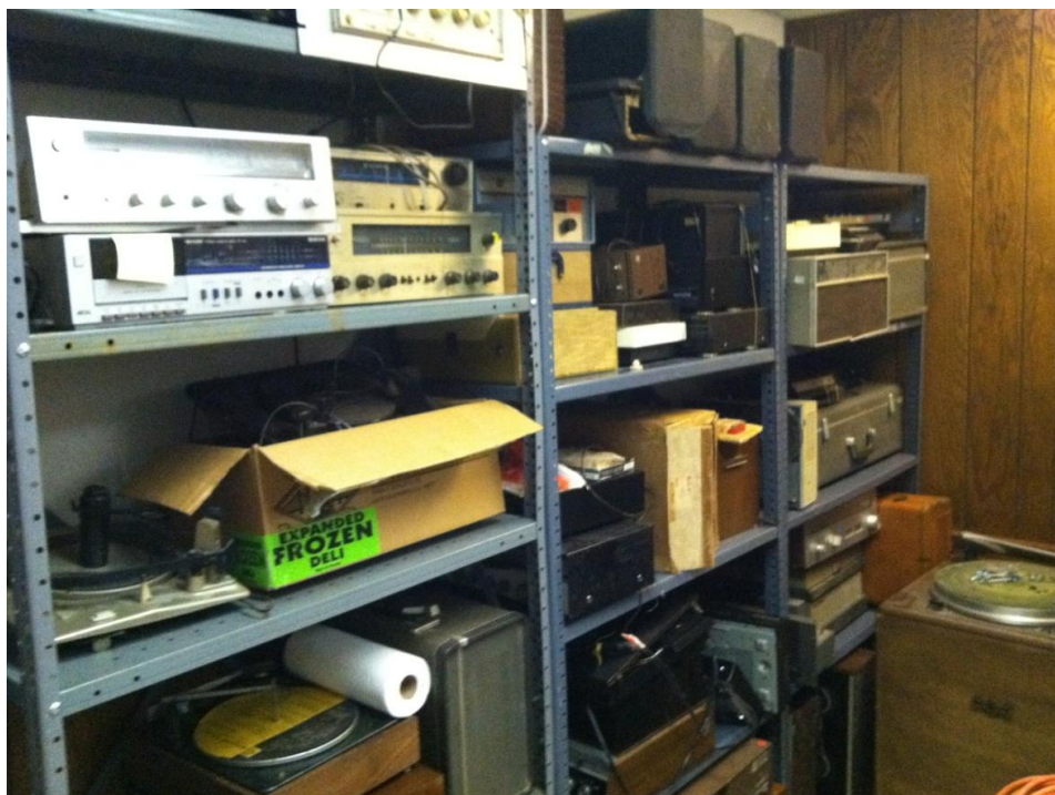
Audio Items which must be moved

We have until July 18 to have the renovation area cleaned out. Therefore, several Thursday workdays will be scheduled to facilitate this move. The following Thursdays will be scheduled work days (9 a.m. to noon) to help get this stuff moved: June 11, June 18, June 25, July 2, July 9 and July 16. If we finish early, some of these later dates may be cancelled. Regular Tuesday and Saturday work days will continue.