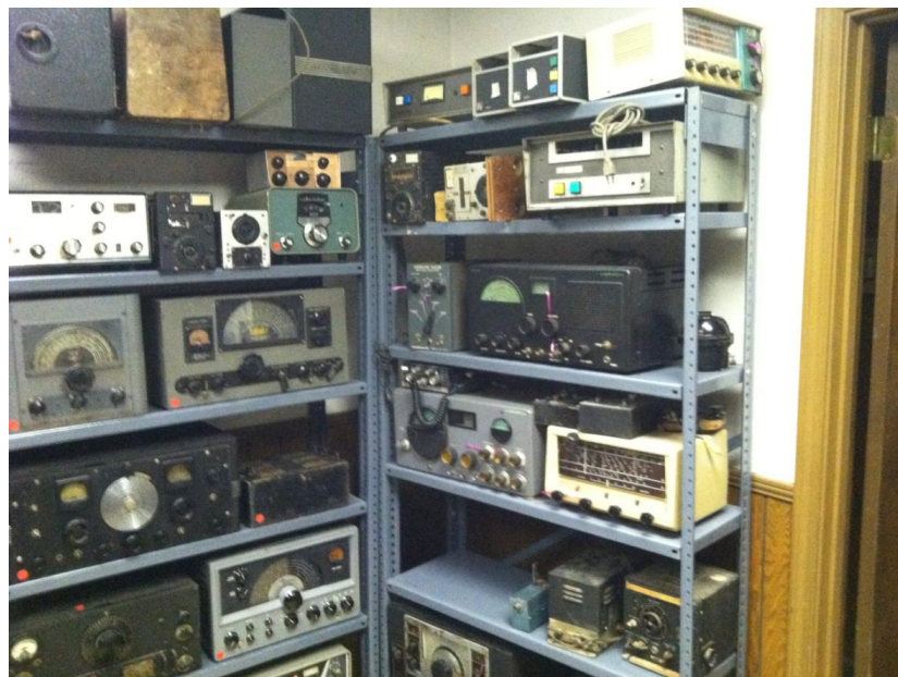
Ham and Shortwave Radios must be moved