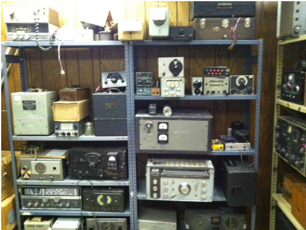
More Ham and Shortwave Radios to be moved