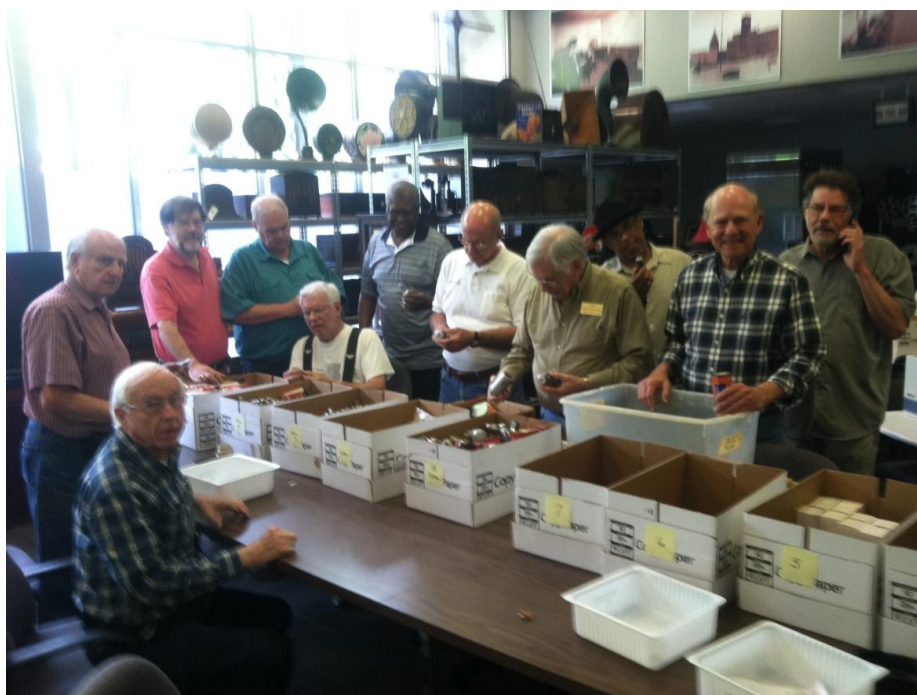
Recent Tube Sorting Work Party

We have until July 18 to have the renovation area cleaned out. Therefore, several Thursday workdays will be scheduled to facilitate this move. The following Thursdays will be scheduled work days (9 a.m. to noon) to help get this stuff moved: June 11, June 18, June 25, July 2, July 9 and July 16. If we finish early, some of these later dates may be cancelled. Regular Tuesday and Saturday work days will continue.