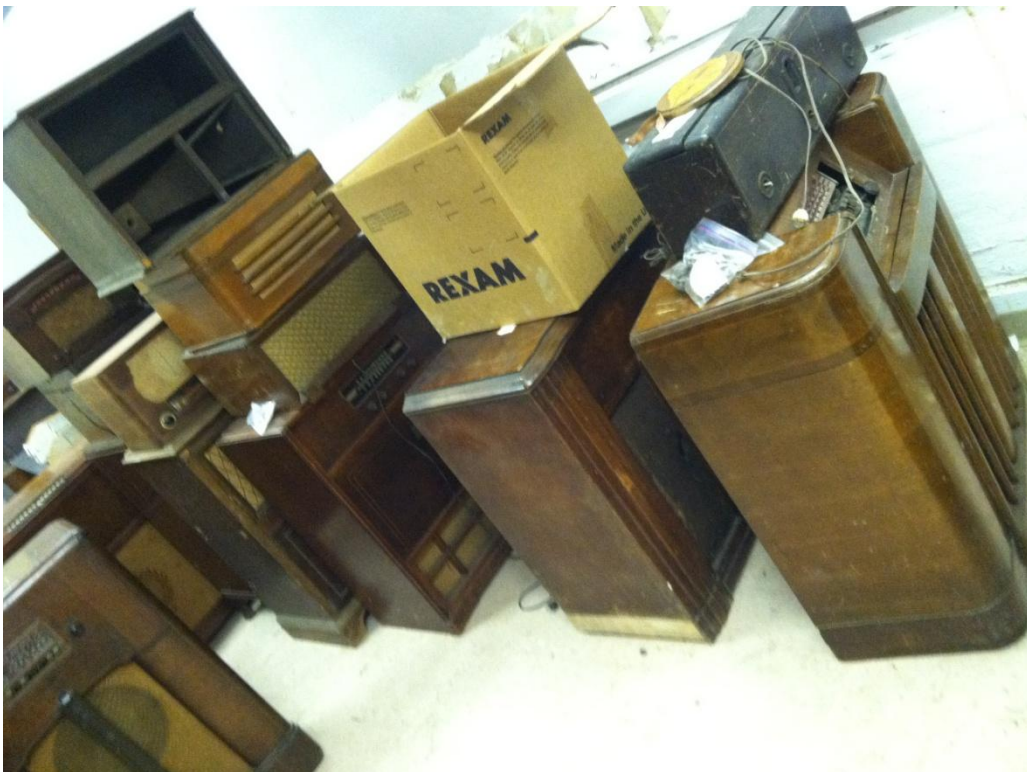
Some of the many consoles to removed from storage