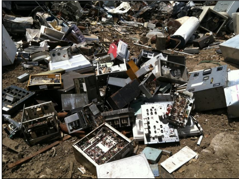
Eight hundred eighty pounds of Scrap

I mentioned last month about the scrap radios and surplus equipment that we carried to the scrap yard. Here is a picture of the 880 pounds of stuff we unloaded.