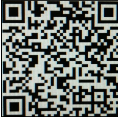
QR Code for one of our Museum radios