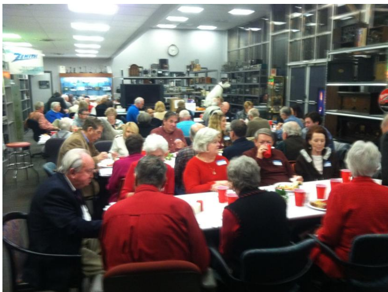
2014 Christmas Party

The calendar year is ending, but our fiscal year is just half gone. The holiday season brings excitement to our kids and grandkids and our extended families. Travel is on the agenda and good food and fellowship are everywhere. Our Christmas party on December 28 will have plenty of good food and fellowship. I hope each of you who can, will attend the party! I have included some pictures from last year's Christmas Party.