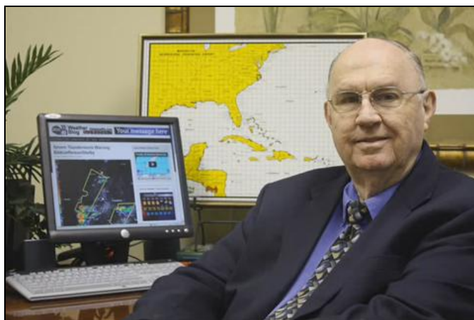
OLD TIME RADIO BITS

Well Folks, seems like I'm sorta stuck on Gunsmoke again this month.