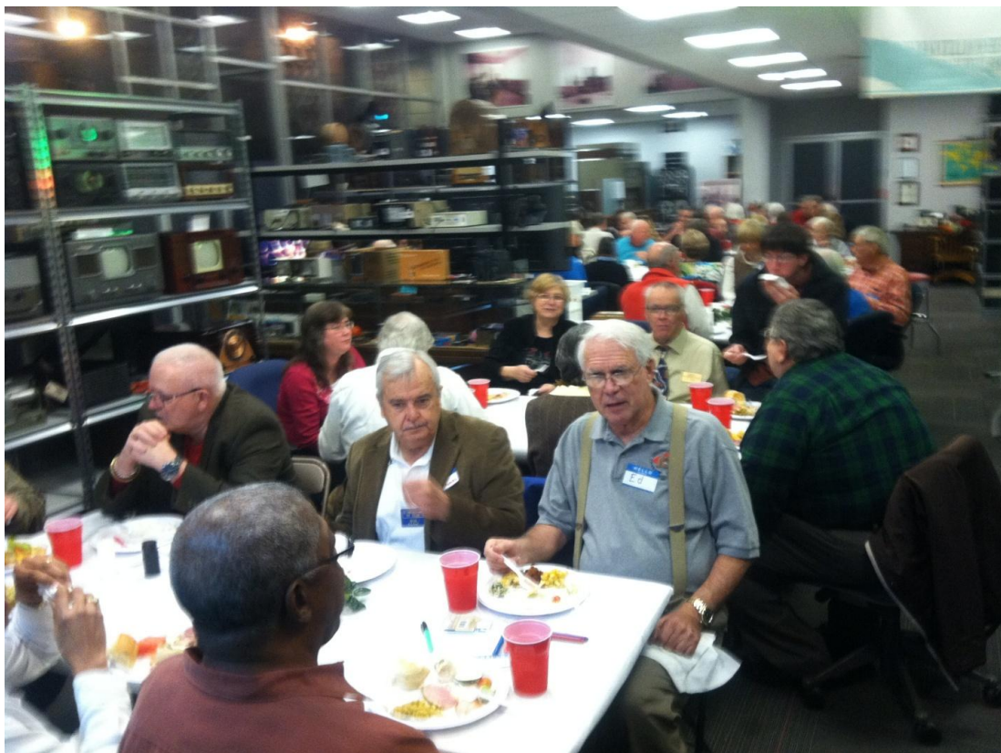
2014 Christmas Party

We have added some more display shelves in the big room, so space will be at a premium, but we will squeeze everyone in somewhere. The Society will provide the meats, dressing, rolls, drinks and the plates, cups and utensils. The members will provide the salads, vegetables and desserts. It all comes together in one great meal for everyone. There is a sign-up sheet at the Shop, or you can send me an e-mail if you plan to attend.