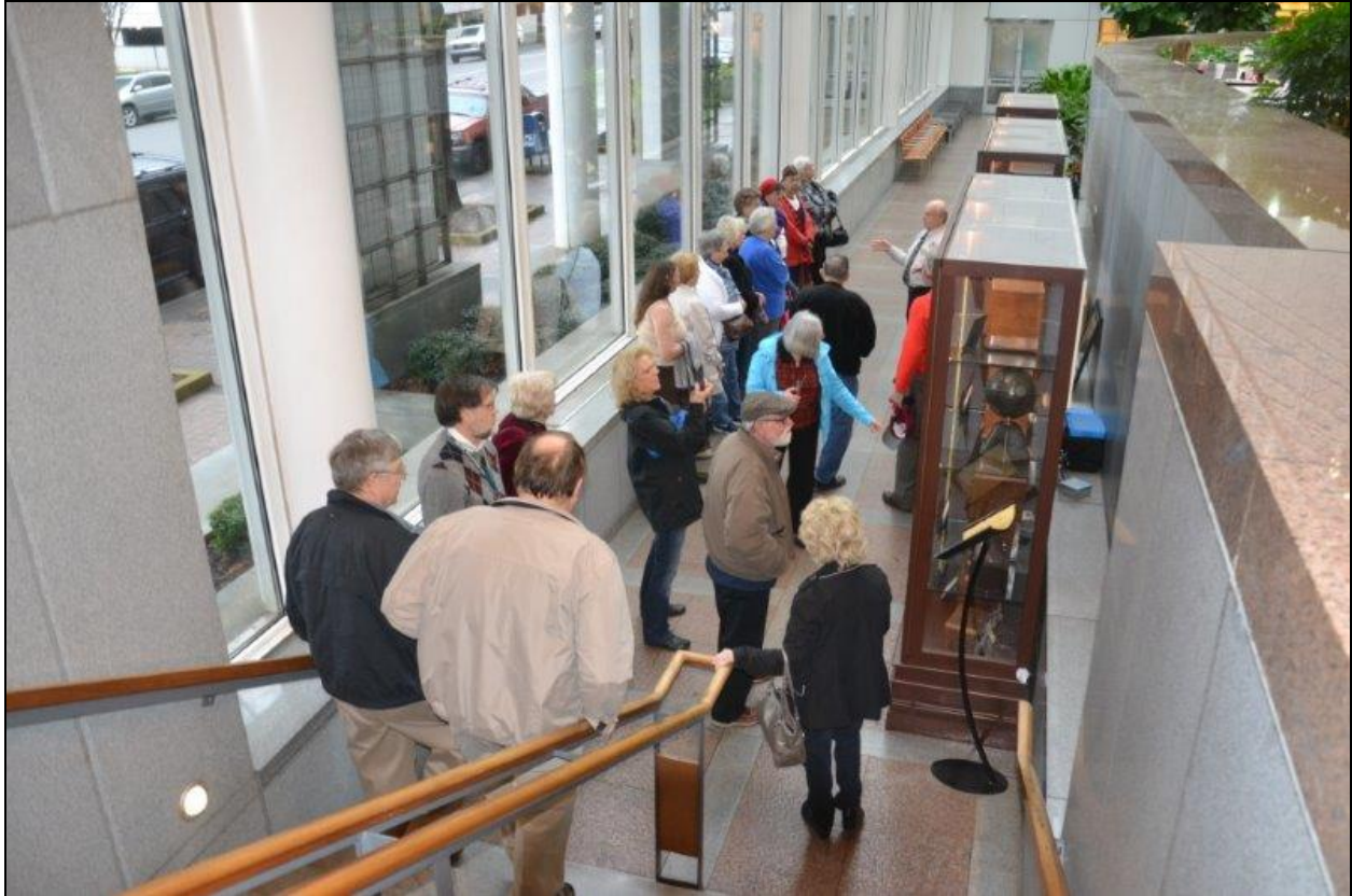
Gardendale Senior Citizens tour the Don Kresge Memorial Museum.