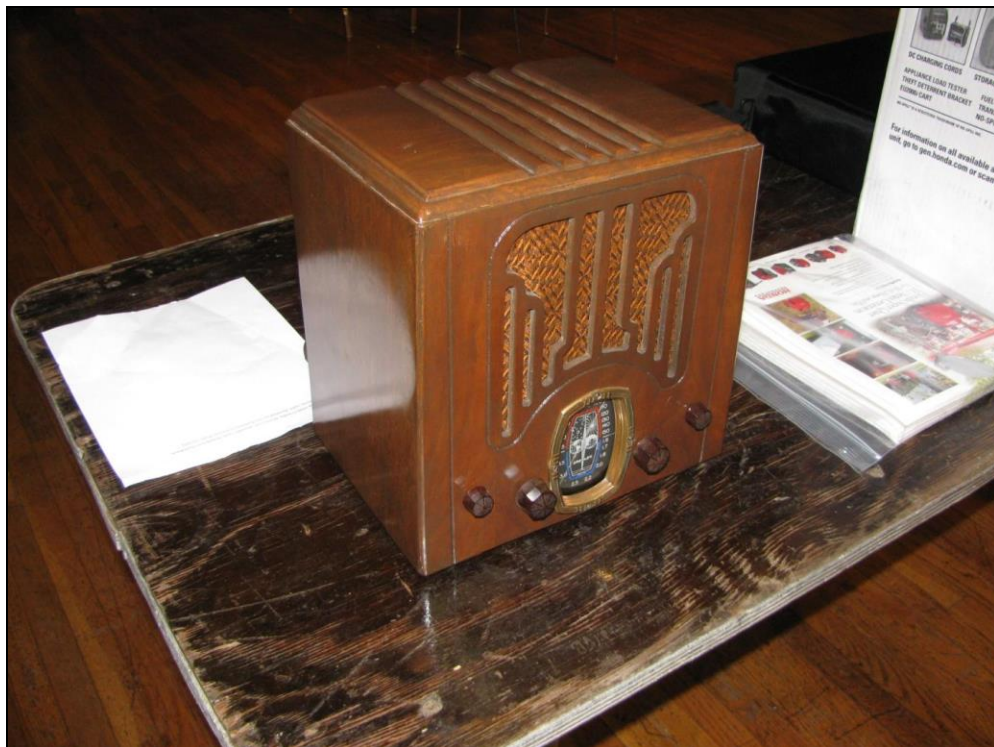
A restored wooden radio given by the Society to BARC for a Door Prize.