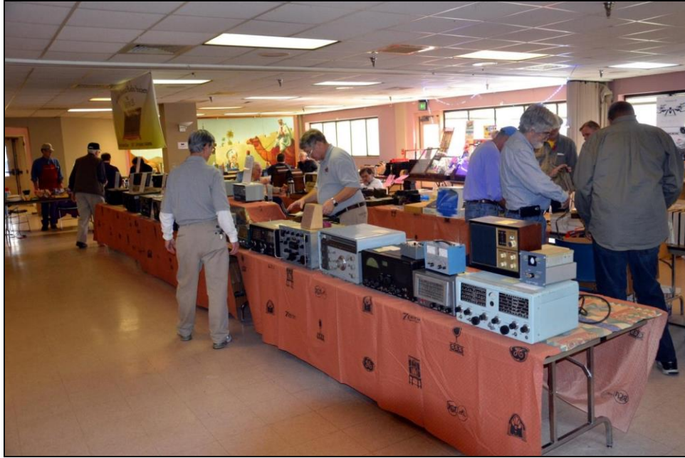
Working Shortwave Radios including Heathkits, National, a Collins R390A and Hallicrafters for sale.