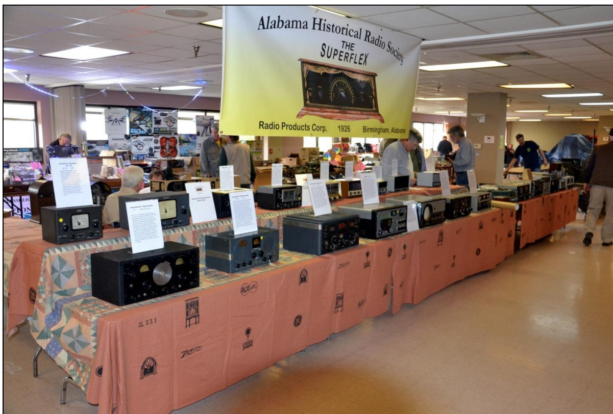
Hallicrafters Radio Display, including several Echophone Models