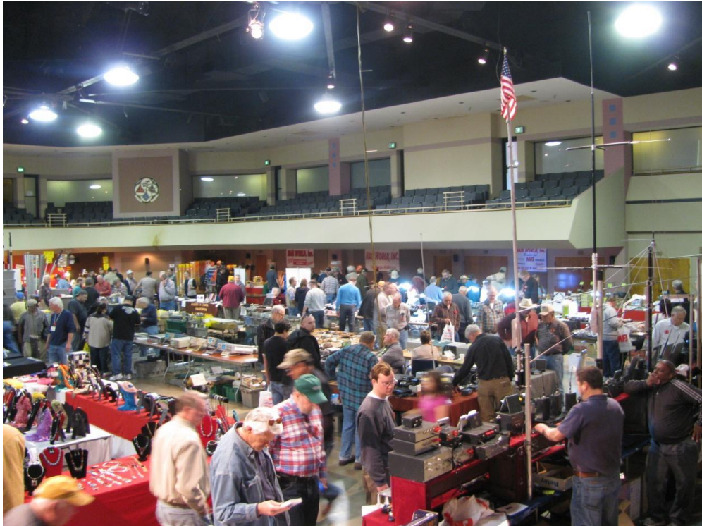
Early Friday evening shoppers on the Main Floor