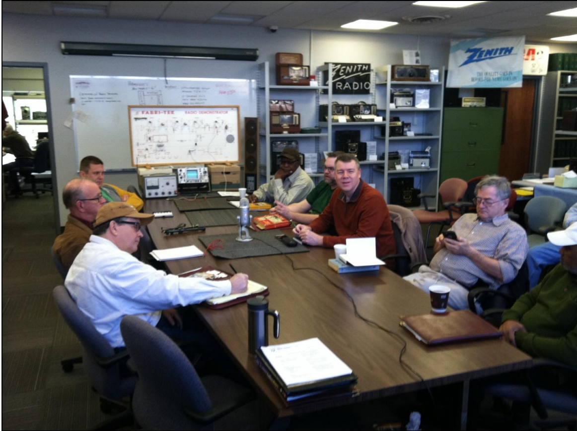
February Radio Class showing the Radio Demonstrator, Signal Generator, Scope and students.