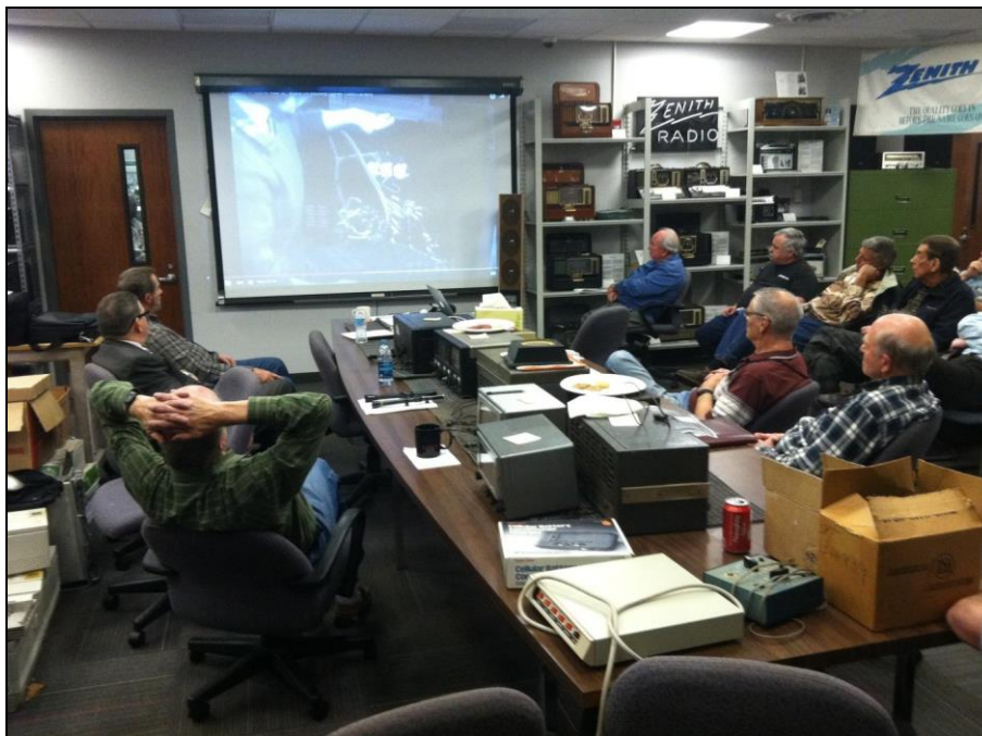
February Monday Night Meeting Program on Hallicrafters - Watching World War II Video.

The February Monday night meeting was held on February 22 at the Shop. The program was a preview of the Forum Program to be presented at the Ham Fest. Here is the group watching the Hallicrafters video on World War II communications.