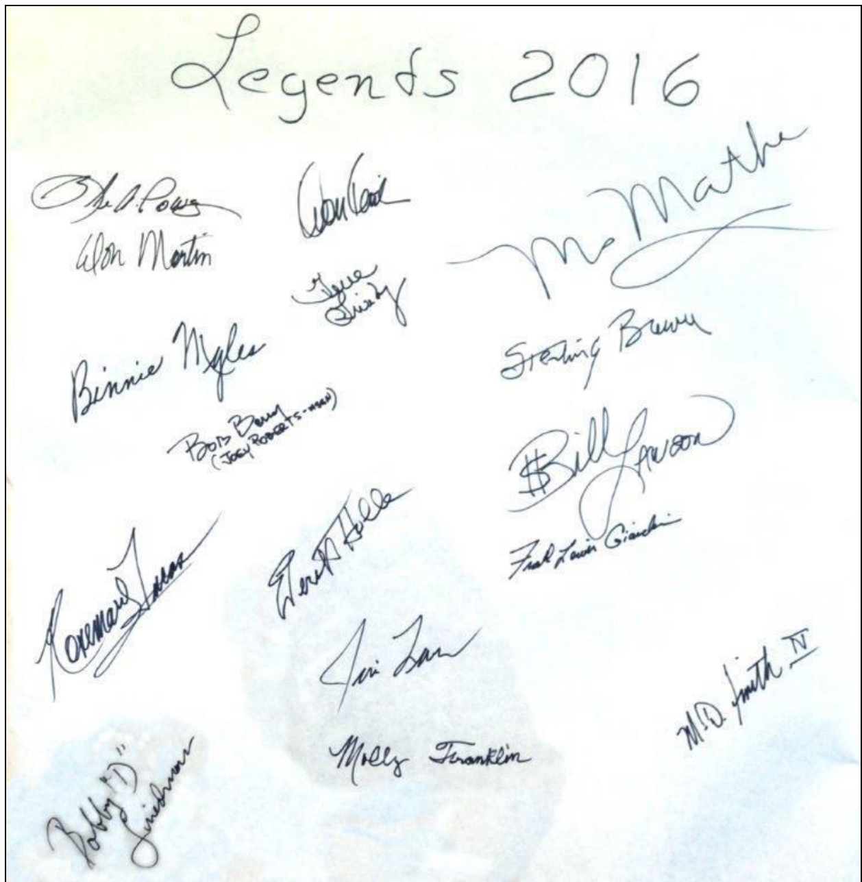
Most of the Legends signed the poster

Those attending the Legends event are looking forward to next year's event, scheduled for the third Thursday in April, at 9 a.m. at the Shop in Birmingham.