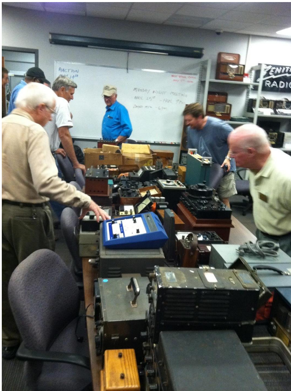
Some of Hails' donation items on display

Many of the Hails' donation items still remain in about 60 boxes in our Annex, waiting to be opened. It will be a month or so before we can open them all. Maybe at the May Monday night meeting we can open another group of them. Some items have been cleaned up and put on display at the Shop. Some of the test equipment has been placed in service in the Shop at the work benches. And some items will be placed in the auction to be held on May 14 at the Shop.