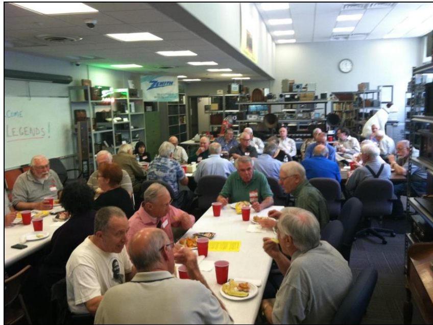
Legends enjoying a meal prepared by Marilyn's Deli and Dog

standpoint. This year's Legends was filled with good food, good stories and the good fellowship that has accompanied this event over the years. About two hours of video tape was shot capturing the unique stories many legends told. The attendees enjoyed their special day and expressed their appreciation for our recognizing them and the radio/television industry in general. As several of them stated, the new radio/television era is more technology driven and fewer people are employed to produce today's programming. Only on-air people are working regularly, while behind the scenes, the ranks are shrinking. The event was captured in pictures and some are included here.