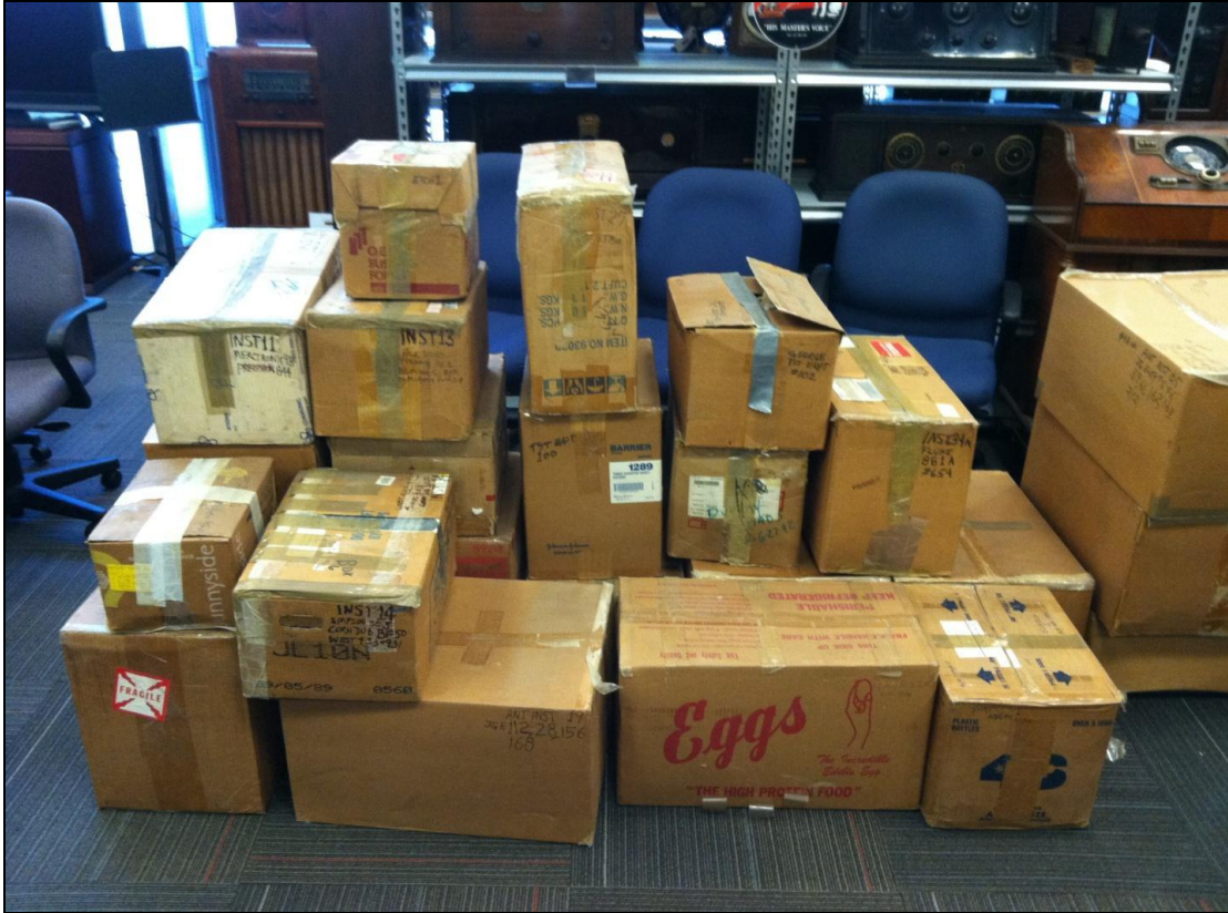
Hails' donation boxes set up for Monday Night program