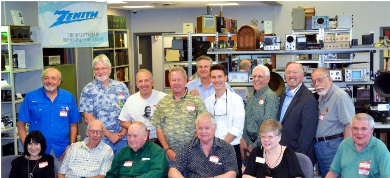
Legend Attendees present at picture time. Several had to leave. Ed Boutwell was making a video and failed to get in the picture.