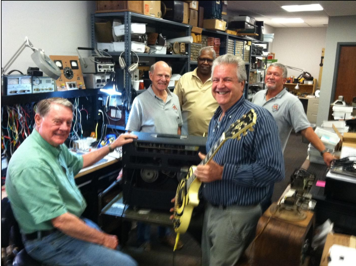
The usual suspects cutting up on a June work day (yes, we work on guitar amps, also)

The next radio class will be on July 2 at the Shop in Birmingham. Guest instructor, Jim Rogers, will continue discussing the different stages in a basic All-American Five AM tube radio and continue instruction on how to use common test equipment.