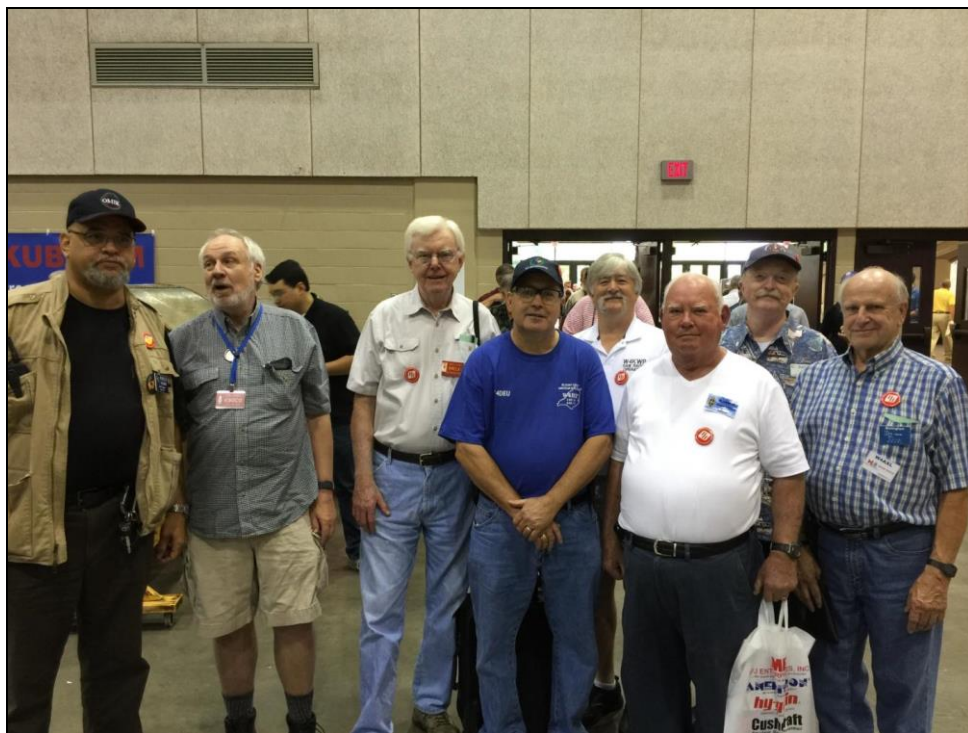
AHRS members attending the 2015 Huntsville Hamfest

If there are five or six members at the tables in Huntsville, there will be a better opportunity for them to check out the other vendor tables and to enjoy the Hamfest. The plan is to travel to Huntsville early Saturday morning with the sale items, to have a great day at the Hamfest and return late Saturday afternoon after the Hamfest closes for the day. There is no plan to attend the Hamfest on Sunday, August 16. The Society will pay for entry buttons for the first six volunteers attending and helping operate the Society tables.