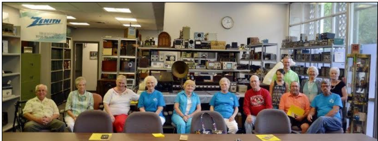
Members from the Olive Grove CMC posing for a picture at the Shop