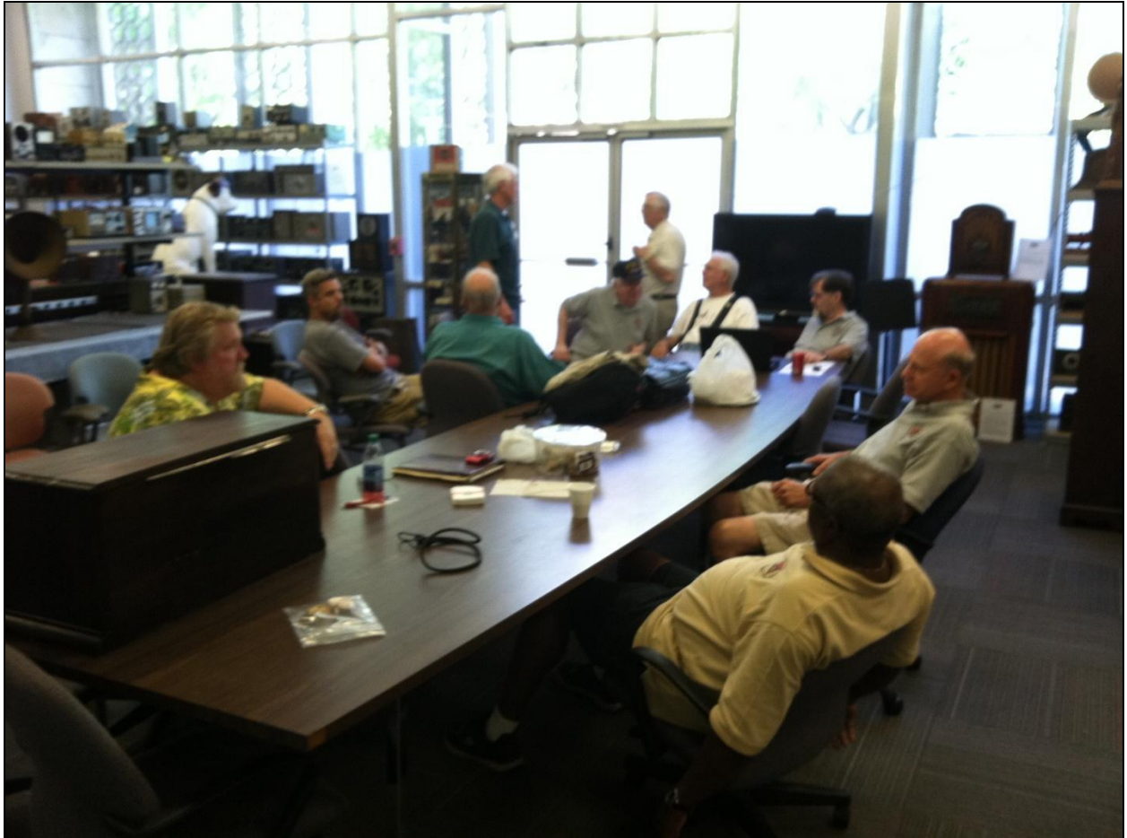
Typical group of members enjoying each other's company on a regular Tuesday workday.

Please plan to come by the Shop on one of our regular workdays, Tuesday and Saturday, from 9 a.m. until around noon, or to one of our Monday night meetings on the fourth Monday night of each month, beginning at 7 p.m. and join in fellowship and learn how to work on old radios. Bring in that antique radio you purchased at the local thrift store and show it off.