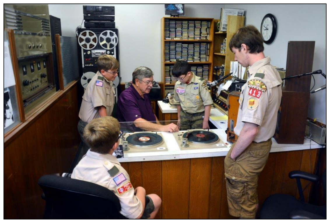
I enjoyed showing them how the turntables worked. They learned about records, including 45's, 33 1/3's and 78's.