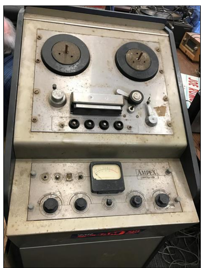
1950's Ampex Series 350 Reel to Reel Recorder with Electronics mounted in a Console.