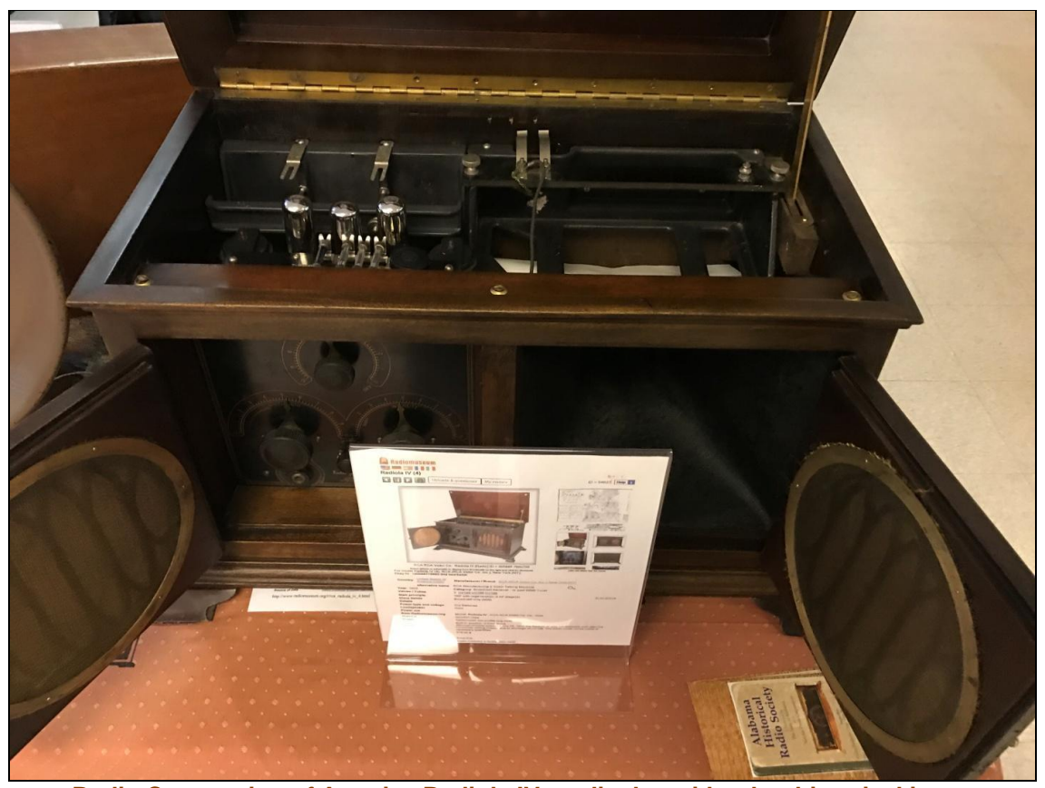
Radio Corporation of America Radiola IV on display with other historical items