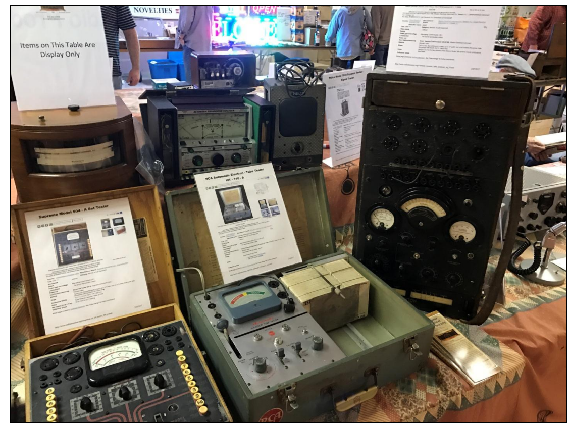
More historical items on display.