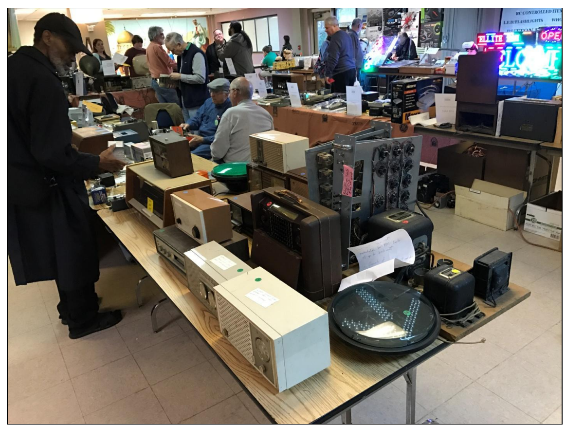
Items for sale at our booth.