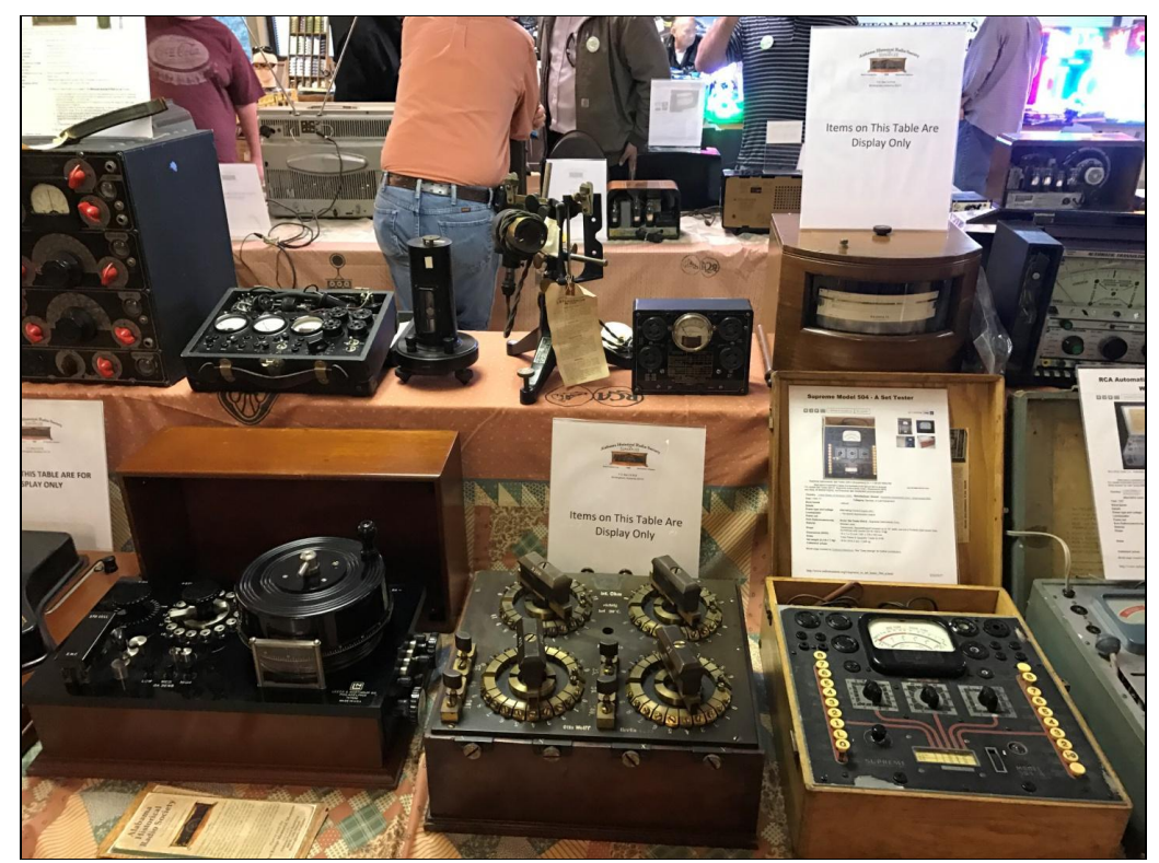
Close up of historical items on display.