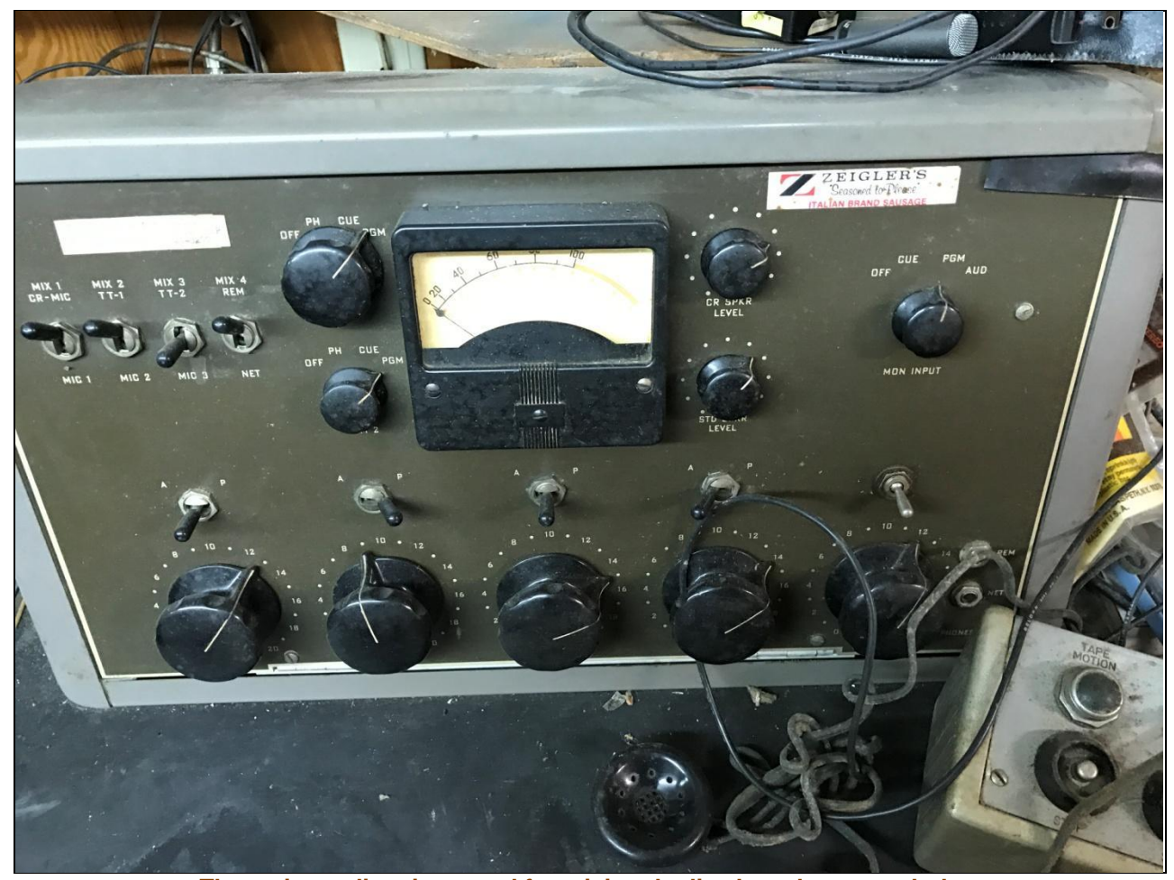
The main studio mixer used for mixing the live broadcasts each day.