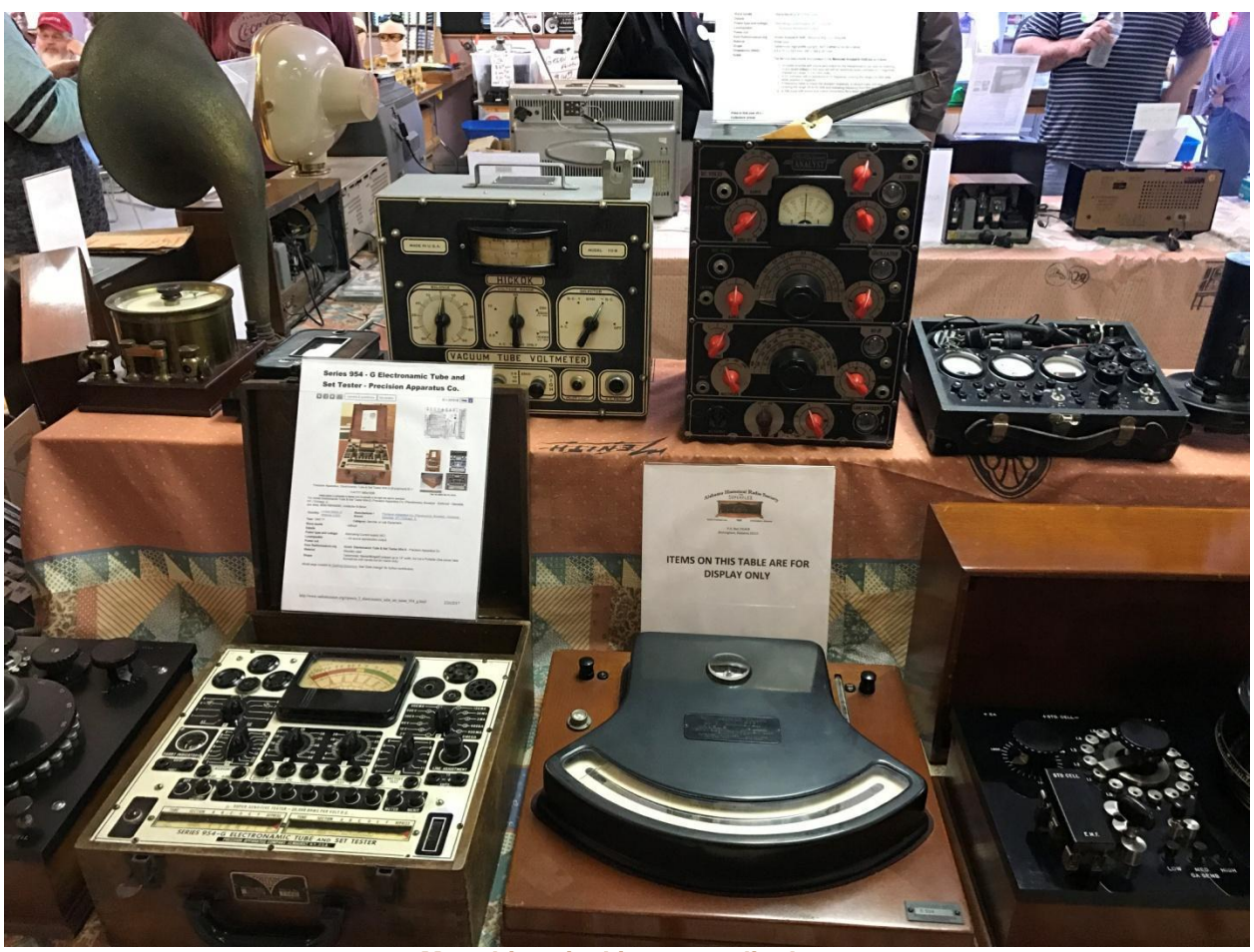
More historical items on display.