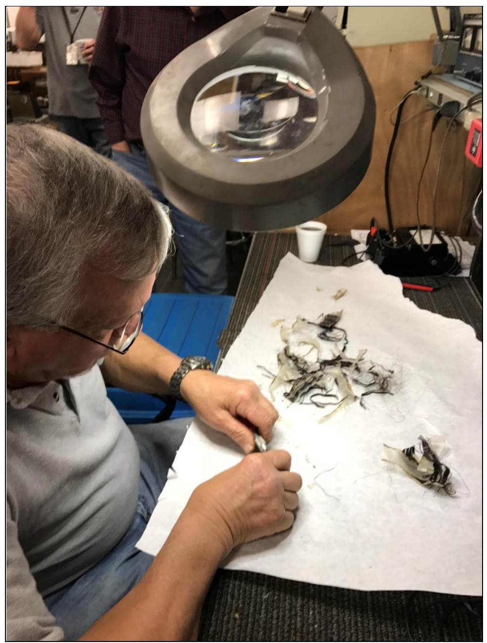
Doc Holiday unwinding a transformer to reclaim the form to wind a new transformer.

At the March Monday night meeting, Dave Cisco presented a brief discussion about an upcoming major donation that includes over 100 radios, primarily Halicrafters, along with military radios, test equipment, old telephones, tubes, parts, teletype machines and much more. In the picture with Dave there is a seven-foot-tall equipment rack filled with military "boat anchors" that are in excellent condition.