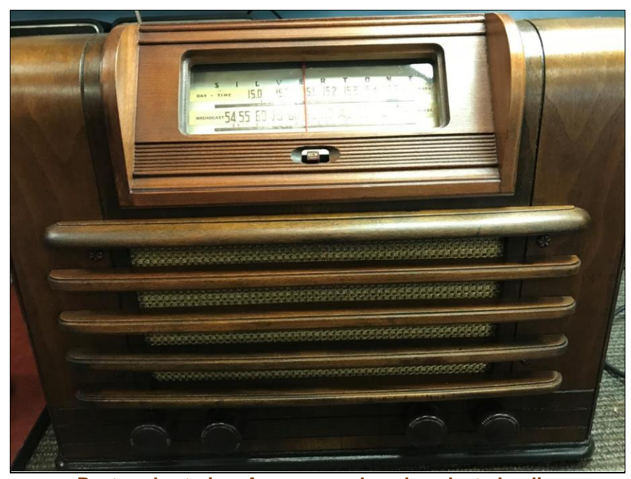
Restored exterior of a very rough and neglected radio.