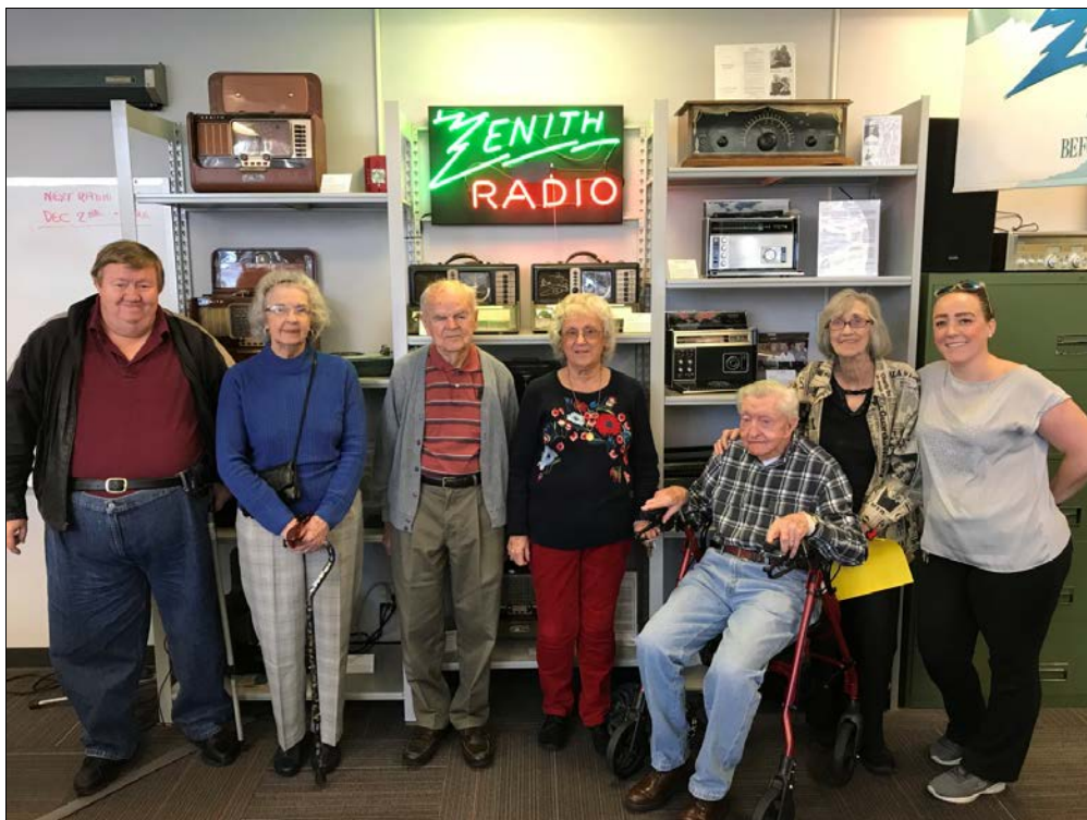
Tour group picture of seniors from St. Martins in the Pines Assisted Living facility.