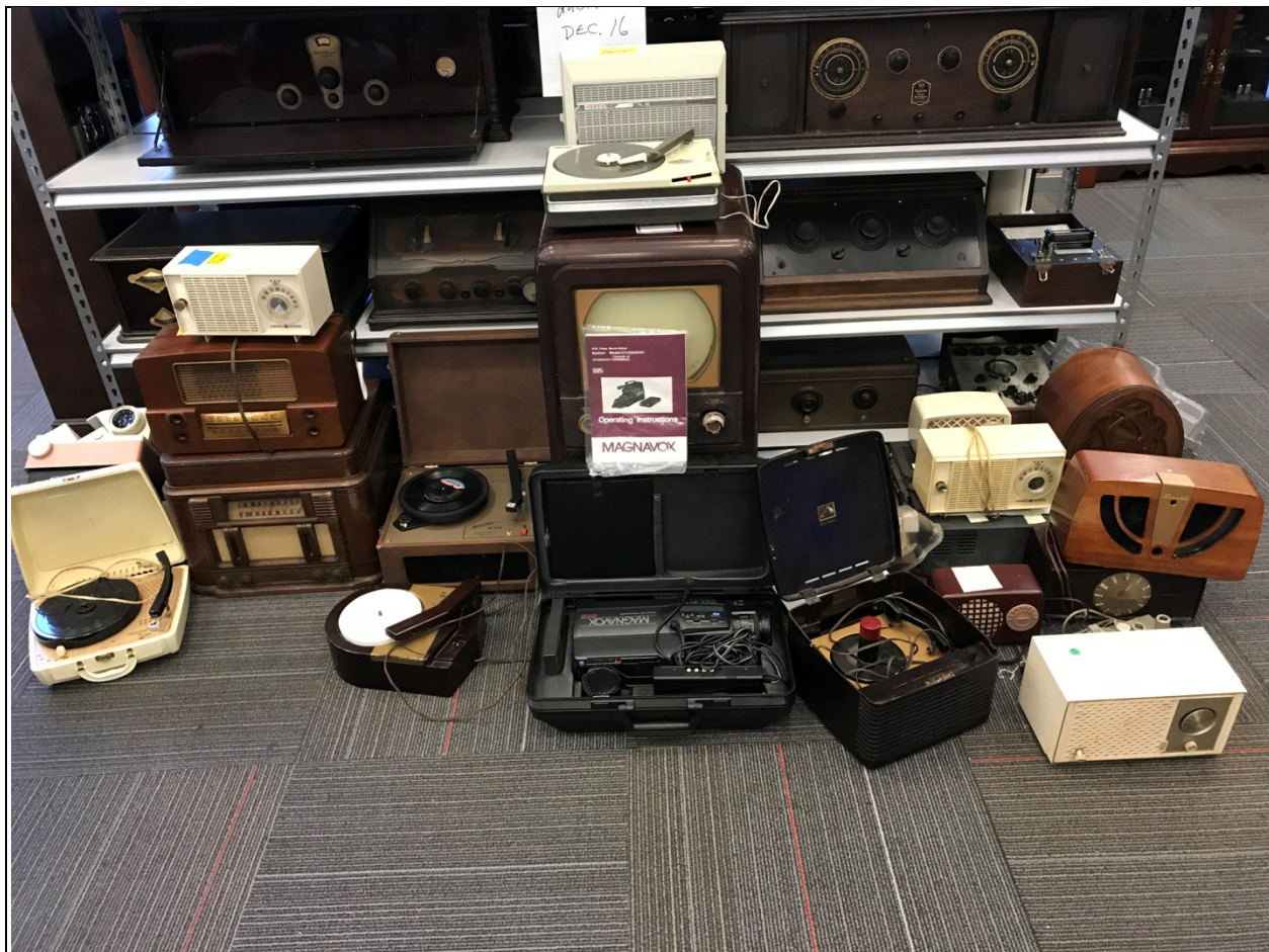
Some of the auction items for the December 16th member auction.

There was a radio auction for members Saturday morning, December 16 at the Shop. Some of the auction items are pictured. Donations were accepted for high bidders.