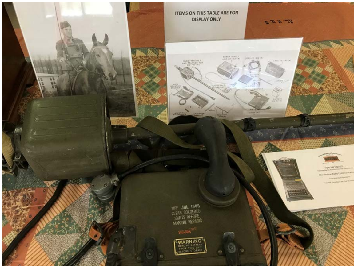
A radio made for use by the military cavalry during World War II on display.