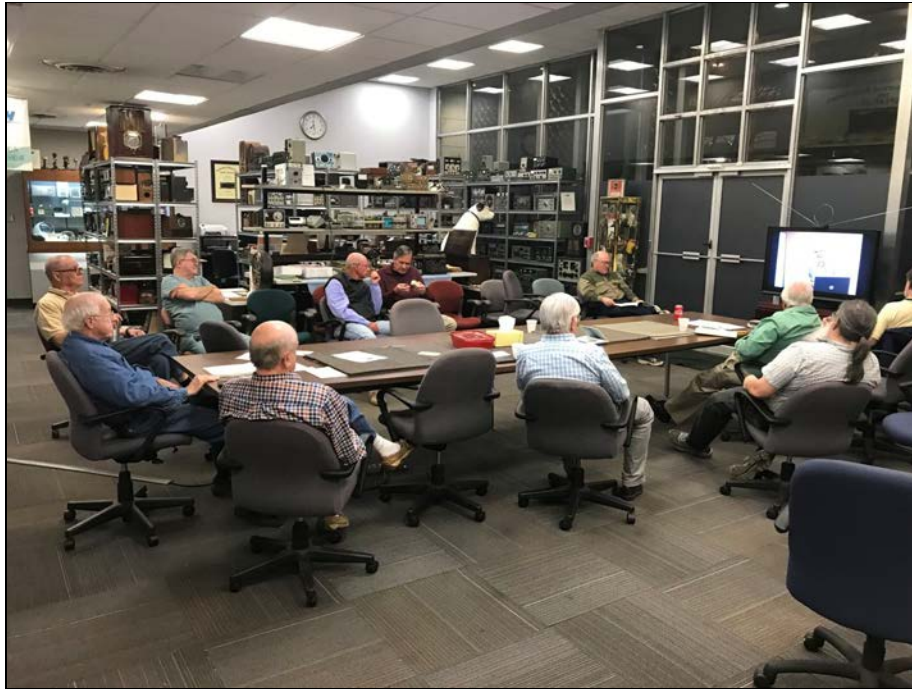
The March Monday night meeting showing the Hamfest Forum video on clandestine radios.

In April of each year since 2011, the Society has held a special event called Legends of Broadcast at the Shop in Birmingham. Every radio and television person, young and old, actively broadcasting or having hung up their headphones, is invited to come have a tour, some great fellowship, a good meal and a couple of hours of telling stories about the "good old days." We have been making videos of the story-telling portion of the day for historical purposes. Many redactions would be required to make anything public. Those in attendance totally enjoy the craziness of early radio and TV. Also, several past attendees have passed away, but their stories live on through our recordings.