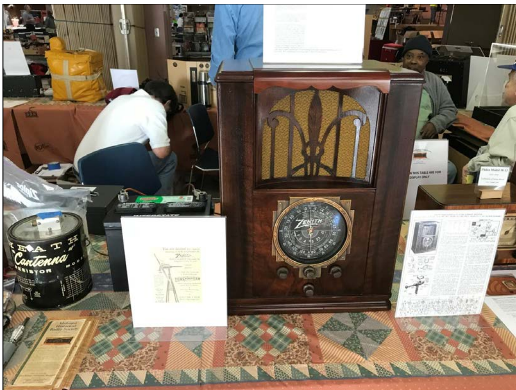
A Zenith Farm Radio, restored by Gene Samples, on display.