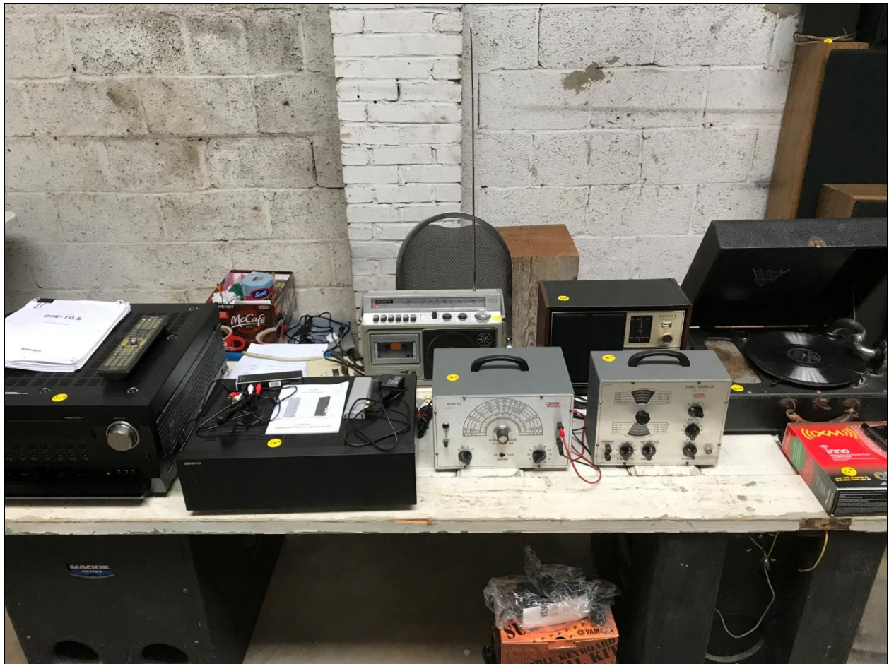
AHRS table for the Stereo Equipment Sale at Tom's Sound in Birmingham. We got some good publicity, as our name was on the event flyer, and many attendees had not heard of us before. Not much income, but great exposure.