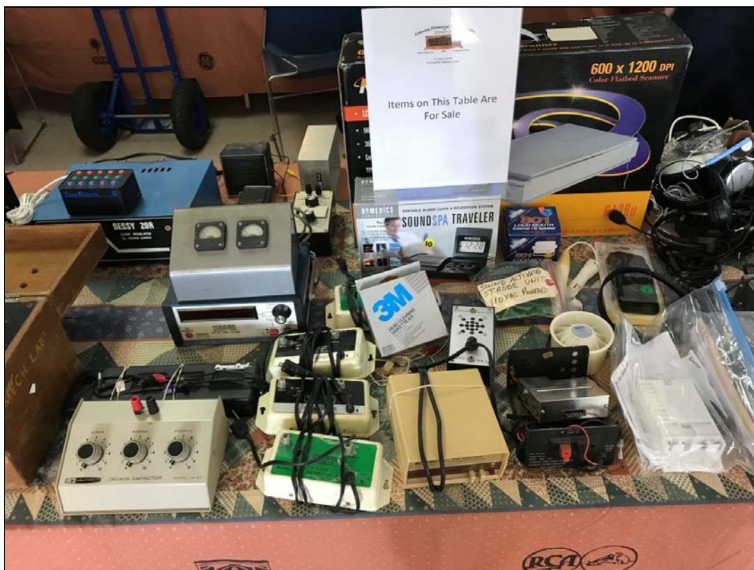
One of many Society tables offering "fine" items for sale.