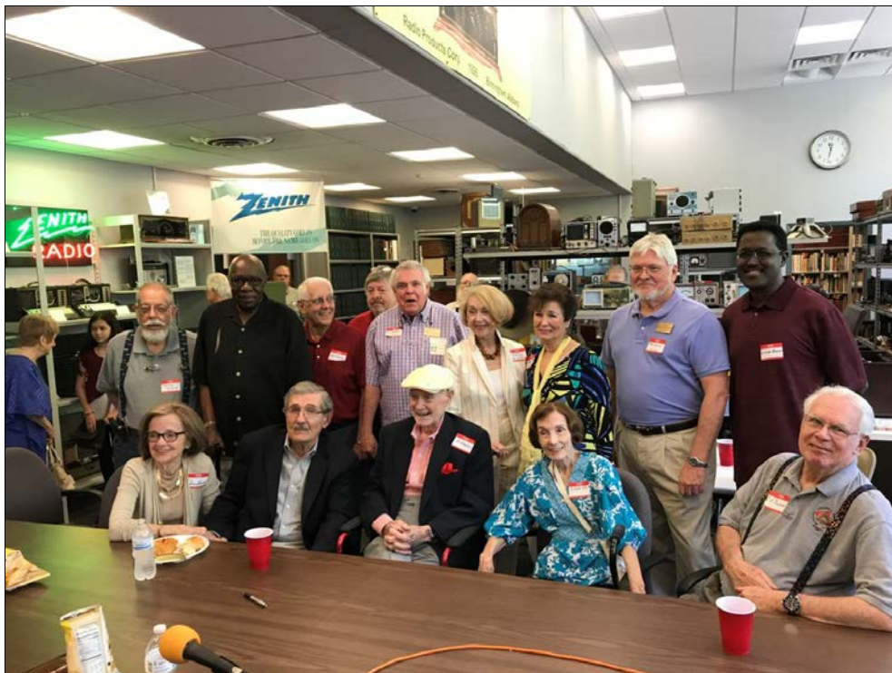
Most of the Legend attendees at the 2017 Legend event. Some left prior to the picture.