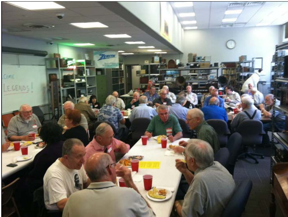
The Legends event begins with a tour and then everyone enjoys a good lunch and fellowship during the meal.

In April of each year since 2011, the Society has held a special event called Legends of Broadcast at the Shop in Birmingham. Every radio and television person, young and old, actively broadcasting or having hung up their headphones, is invited to come have a tour, some great fellowship, a good meal and a couple of hours of telling stories about the "good old days." We have been making videos of the story-telling portion of the day for historical purposes. Many redactions would be required to make anything public. Those in attendance totally enjoy the craziness of early radio and TV. Also, several past attendees have passed away, but their stories live on through our recordings.